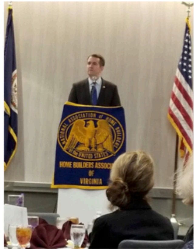
Governor Ralph Northam

The day also featured meetings of the HBAV Legislative Committee, HBAV Build PAC, HBAV Education Foundation, HBAV Membership Committee, Associates Committee, Executive Officers Council, and Local HBA Presidents.